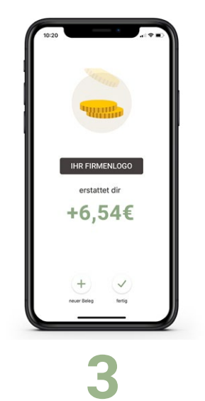
Looking forward to the automatic refund of up to 144 euro with the next salary