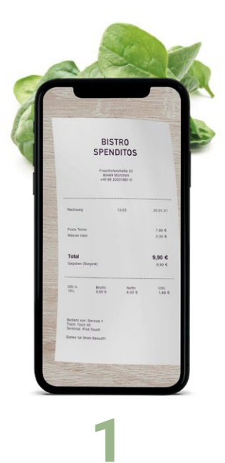
Decide, enjoy & take a photo of the receipt within the app